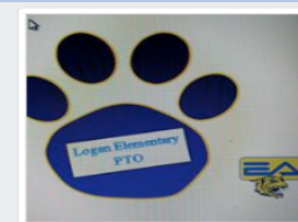
Logan Elementary PTO

Please make sure to like & follow "Logan Elementary PTO"